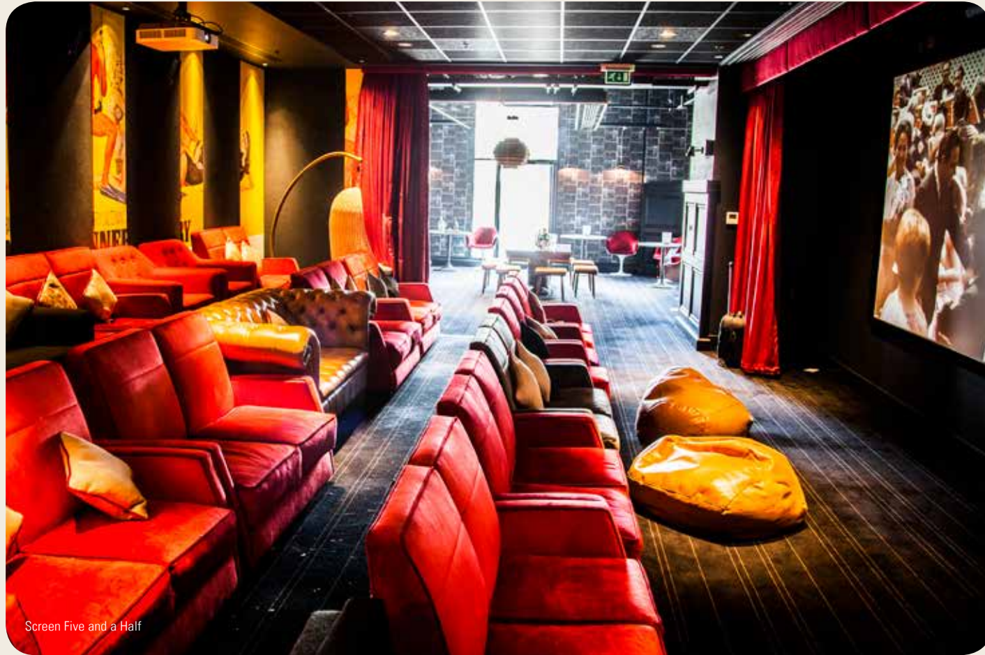
Screen Five and a Half